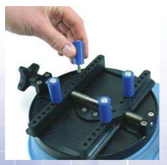
Gripping pegs are easily adjusted to match sample dimensions.