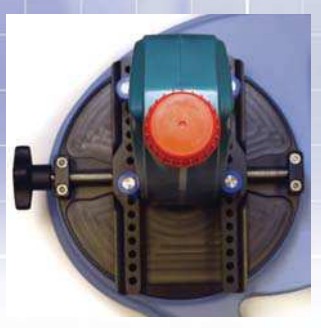
Awkwardly shaped containers are easily accommodated - simply reposition pegs to align the closure over the centre of the mounting table.